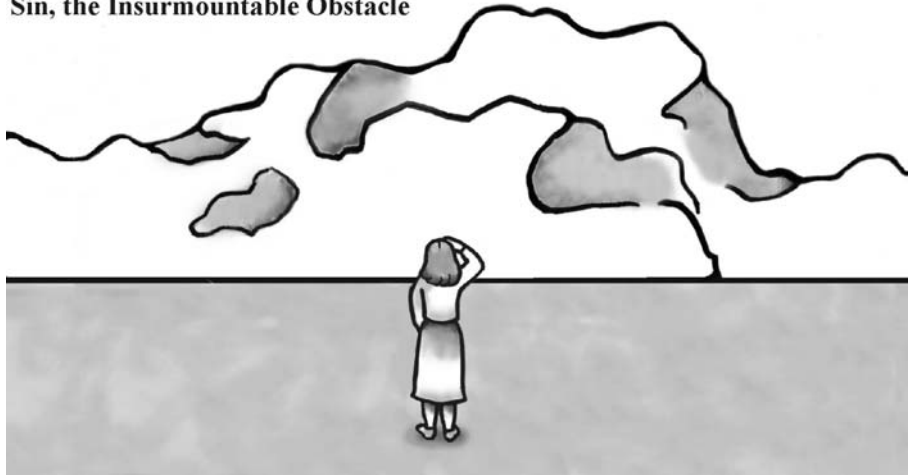
Sin, the Insurmountable Obstacle

From its opening pages the Bible teaches us that there is an insurmountable obstacle standing in the way of salvation: the problem of sin. While God created a perfect world and set man and woman within it to serve as viceroys and stewards over creation, they chose a path of disobedience and rebellion against God (Gen 1-3).