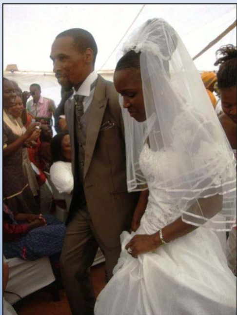
Wedding Bells were ringing

Those who have love are not afraid, because they know that God is with them, and He will provide what they need. They are again courageous to deal honestly with challenges they are facing in their everyday life. They are not afraid to deal with socio-economic and political challenges of the day. One thing that we should regret as South Africans is that we are growing in running away from issues we are facing as a society. Here are the issues that we are not addressing openly and transparently as South Africans: creation of knowledge, economic inequality, land, racism, tribalism and crime. We are therefore reminded that we need South Africans who have faith and hope as they live. This is where MMD ministry comes in. It is an instrument in this community to bring up leaders who are servants and prophetic, and who serve as agents of transformation in their communities.